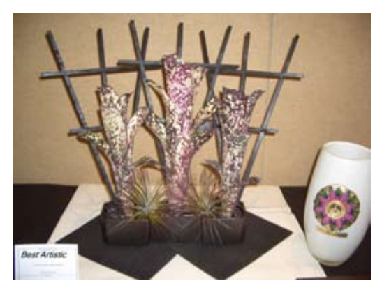
"The Geometry of Bromeliads"—Best Artistic Entry. Note the "Prize" vase; we have to come up with a lot of such awards.