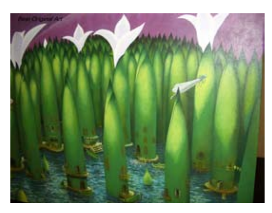
LEFT: Vriesea fosteriana 'Red chestnut', Best of Division II; note the simple pot. ABOVE: Best Original Art.

RIGHT: Billbergia primavers, award-winner for multiple adult Bromeliads.