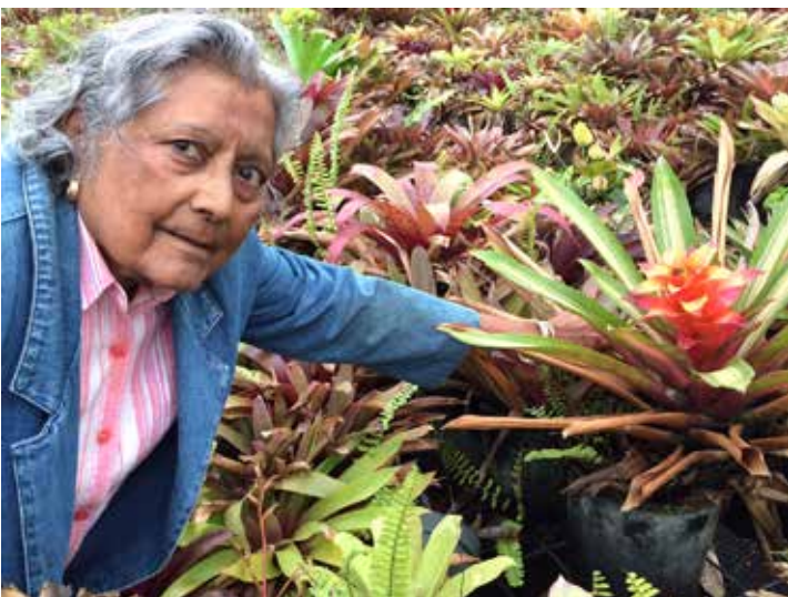
Remember our Identification Classes?!