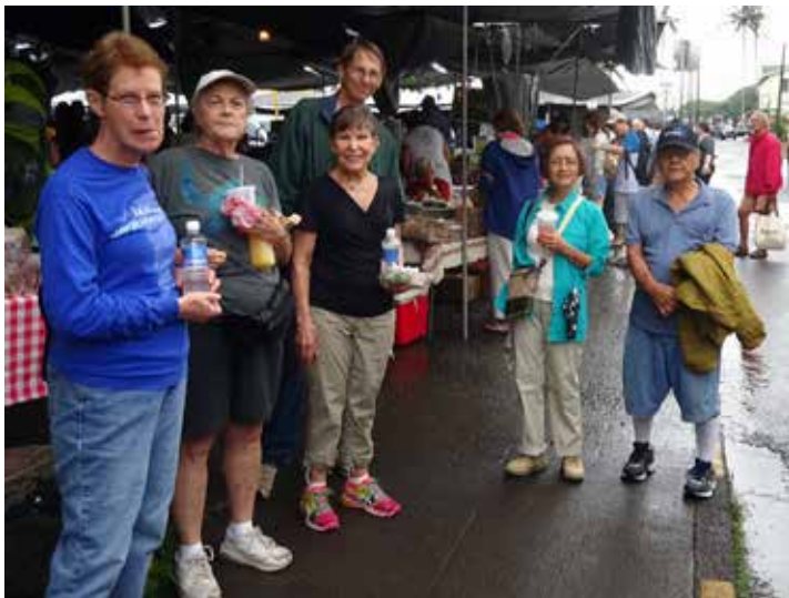
100 percent humidity? I think that's called Rain. The early birds enjoyed breakfast on the go at the Hilo Farmers Market.